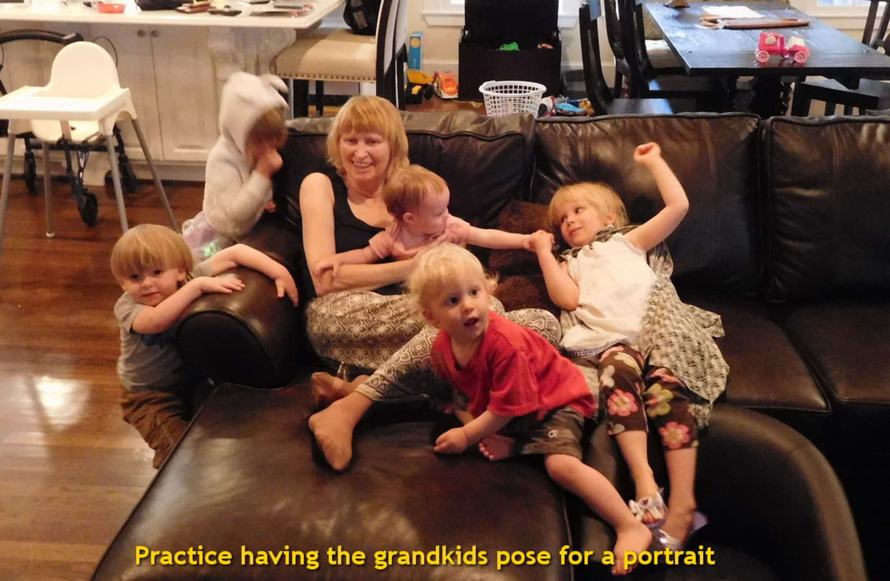
Practice having the grandkids pose for a portrait