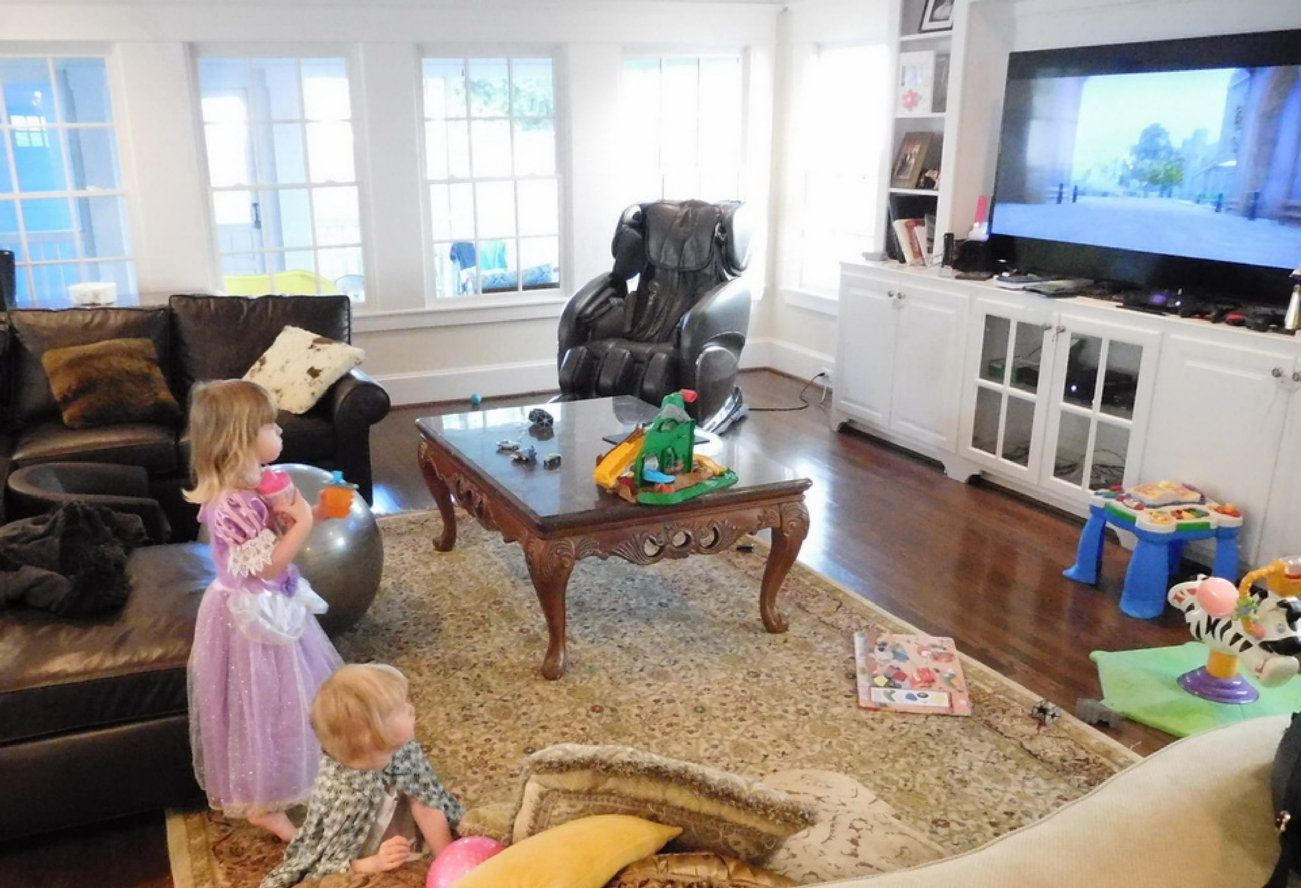
Princess Izzie has a big-screen and lots of movies!