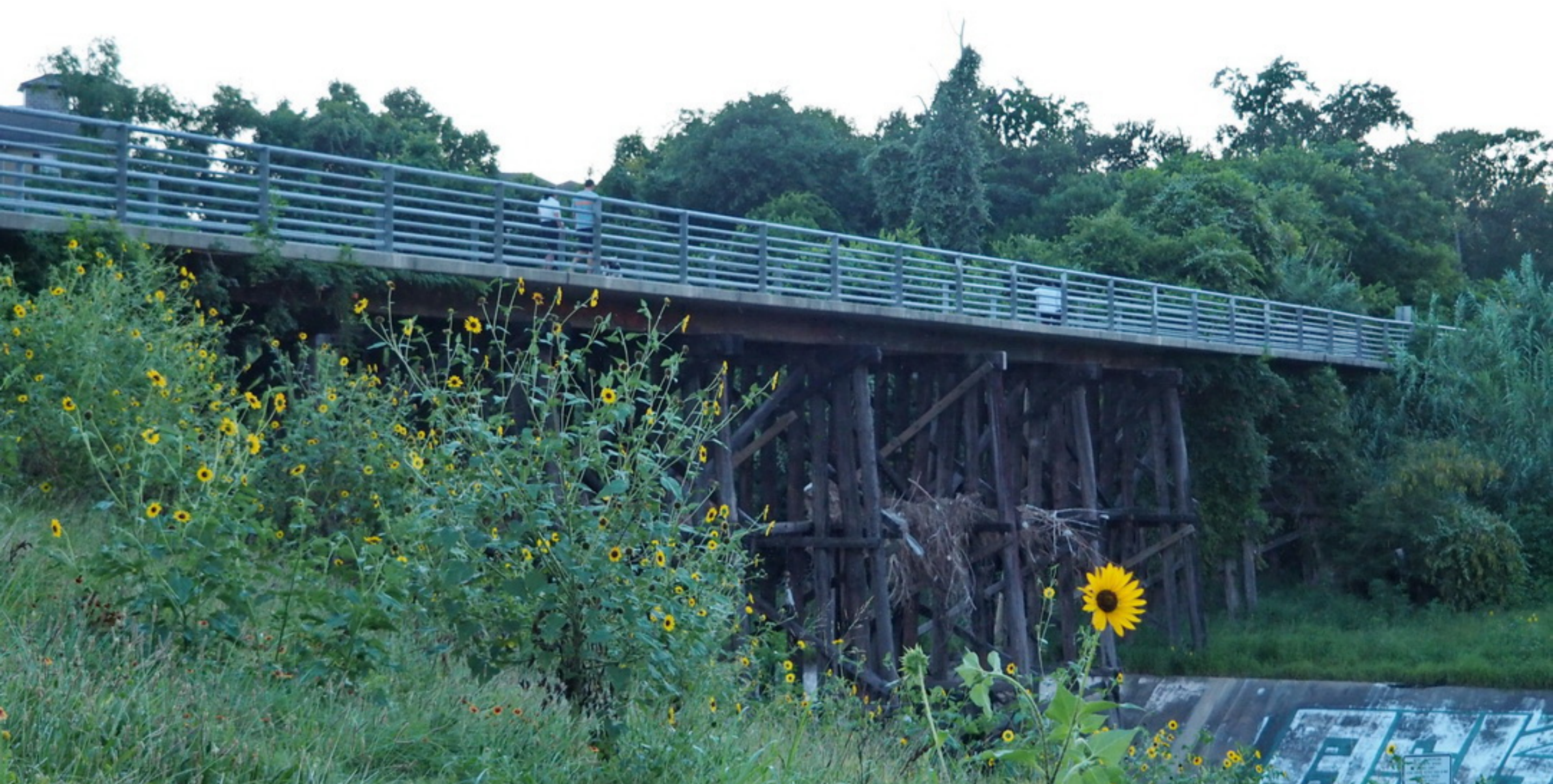
Cross a trestle bridge that Houston has converted into a trail