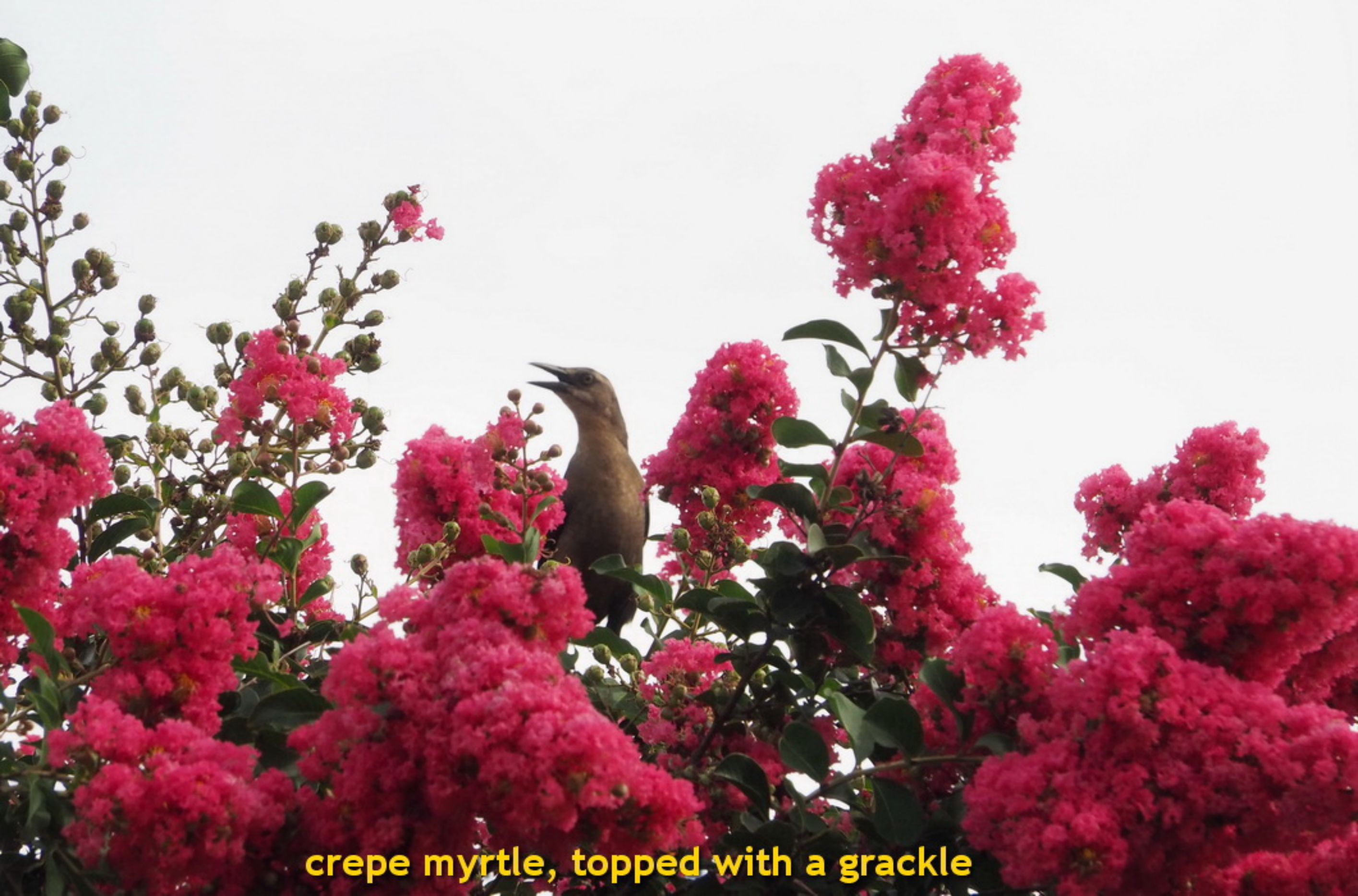
crepe myrtle, topped with a grackle