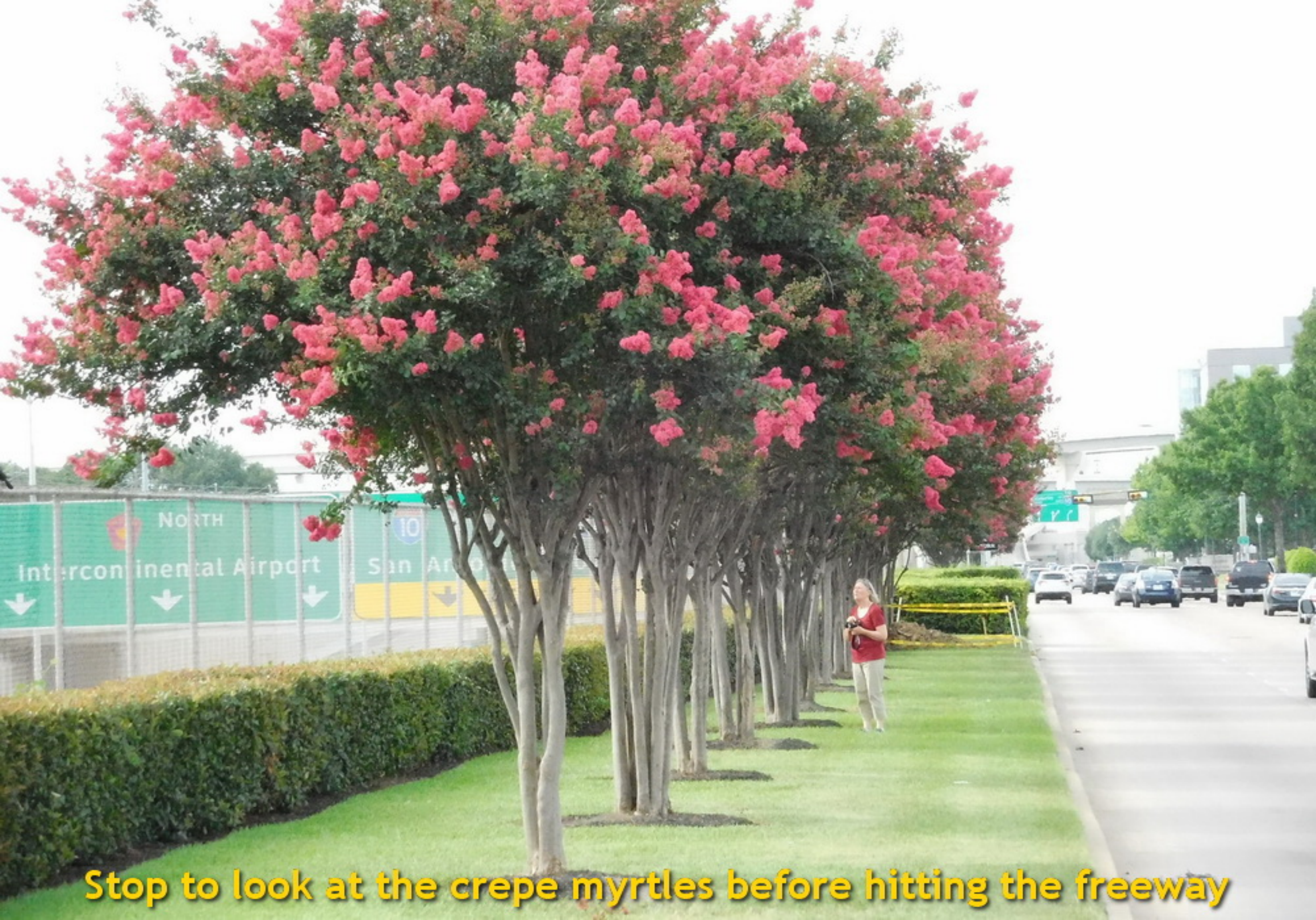
Stop to look at the crepe myrtles before hitting the freeway