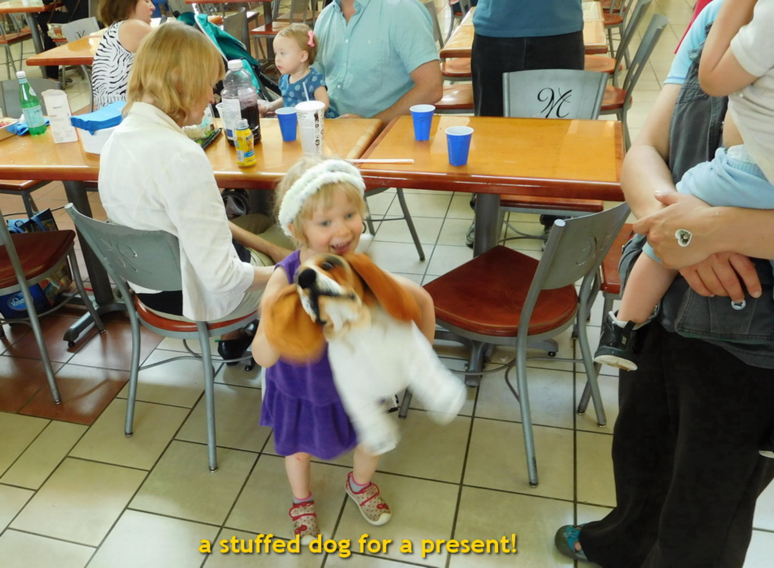
a stuffed dog for a present!