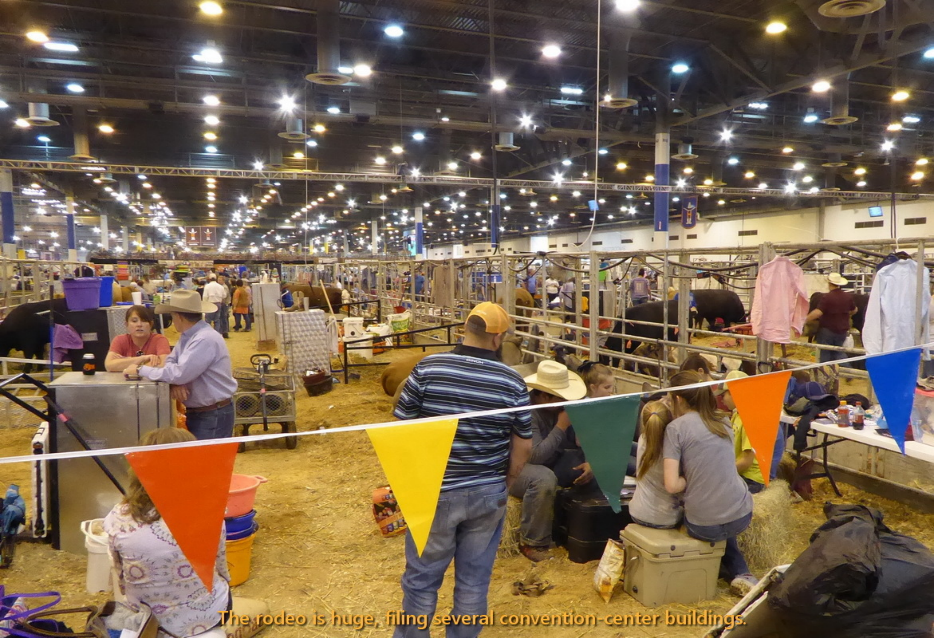
The rodeo is huge, filling several convention-center buildings.