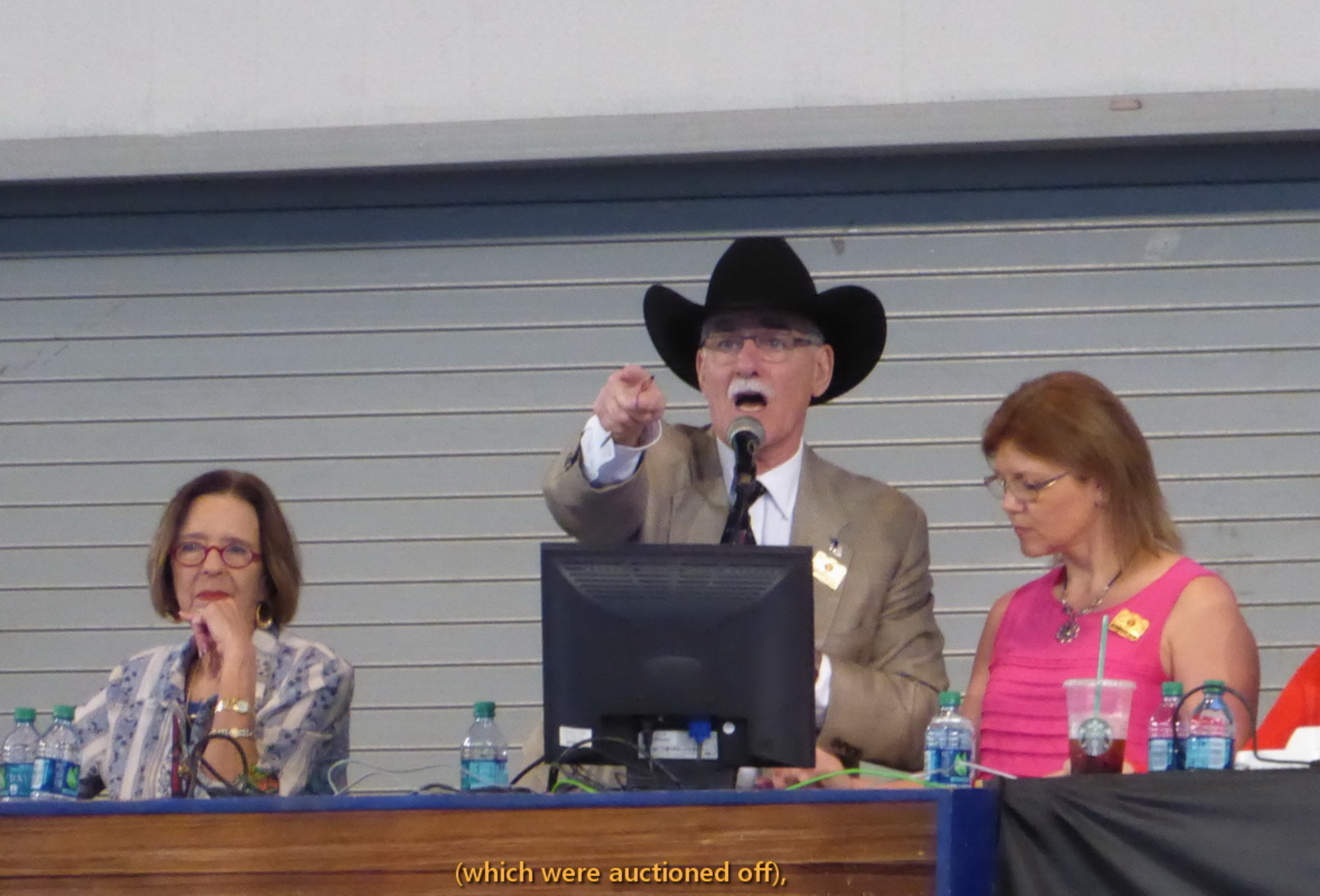
(which were auctioned off),