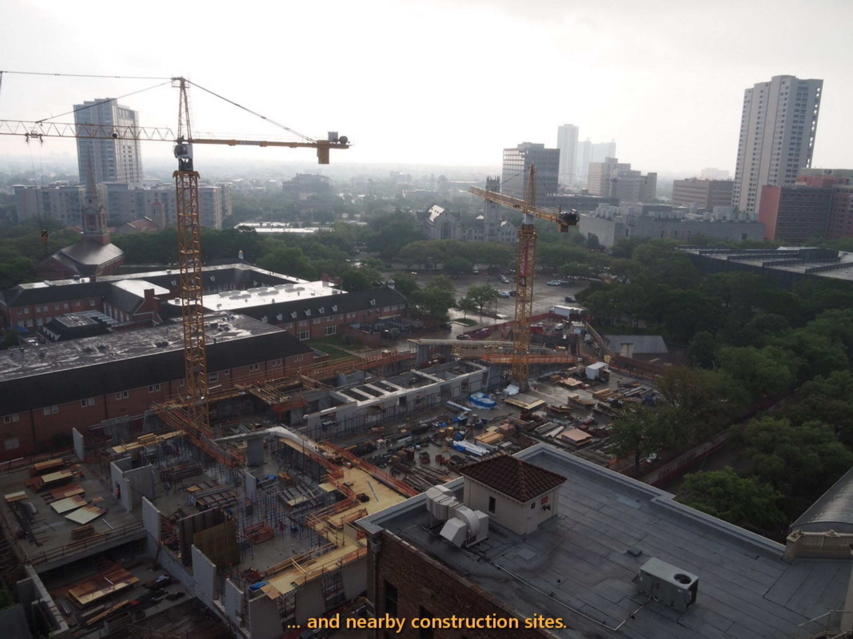
... and nearby construction sites.