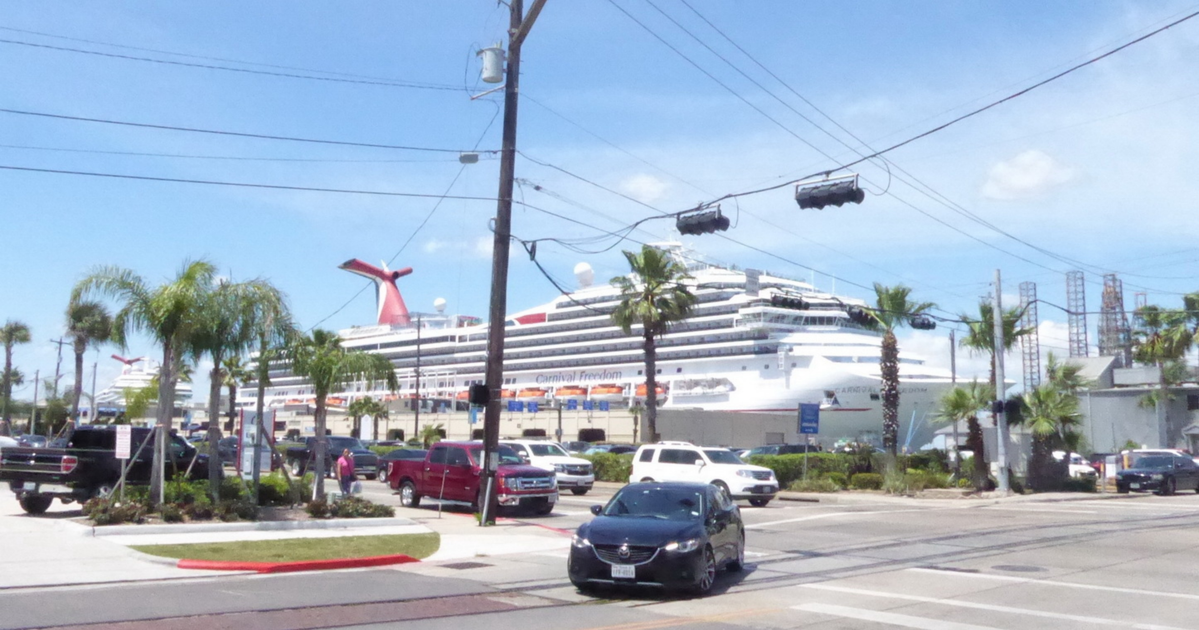
Galveston is kept alive by tourists from the cruise ships.