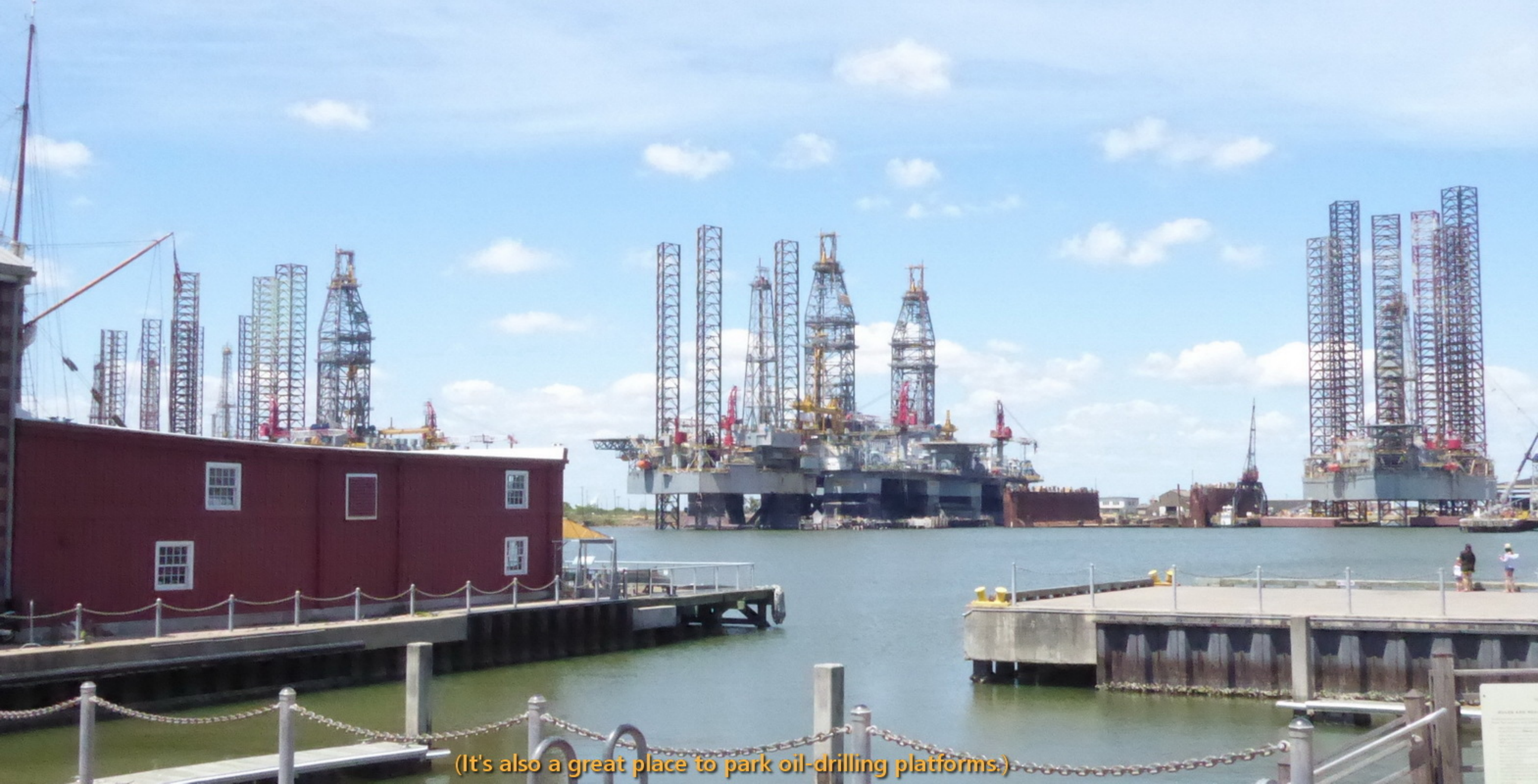
(It's also a great place to park oil-drilling platforms.)