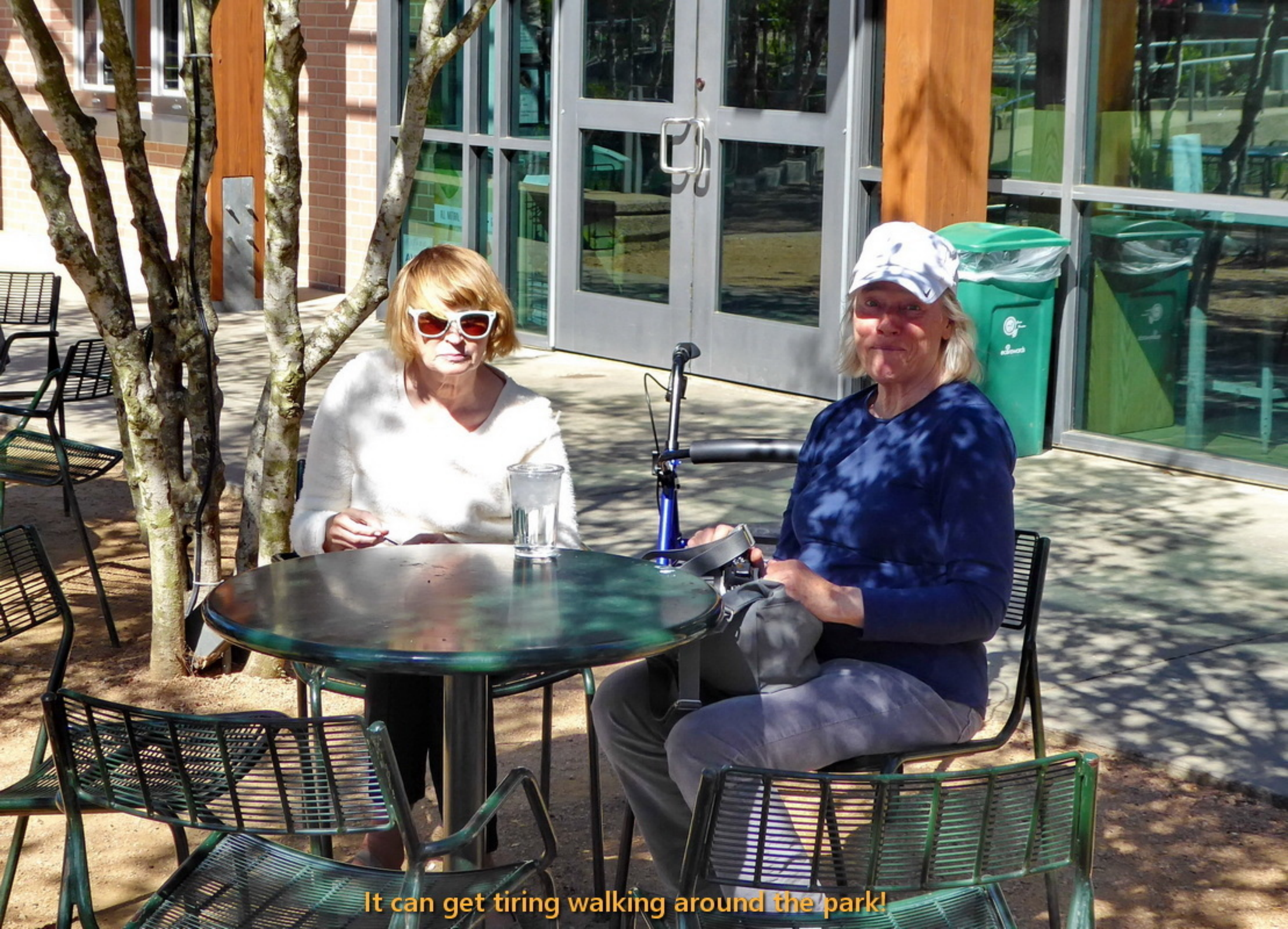
It can get tiring walking around the park!