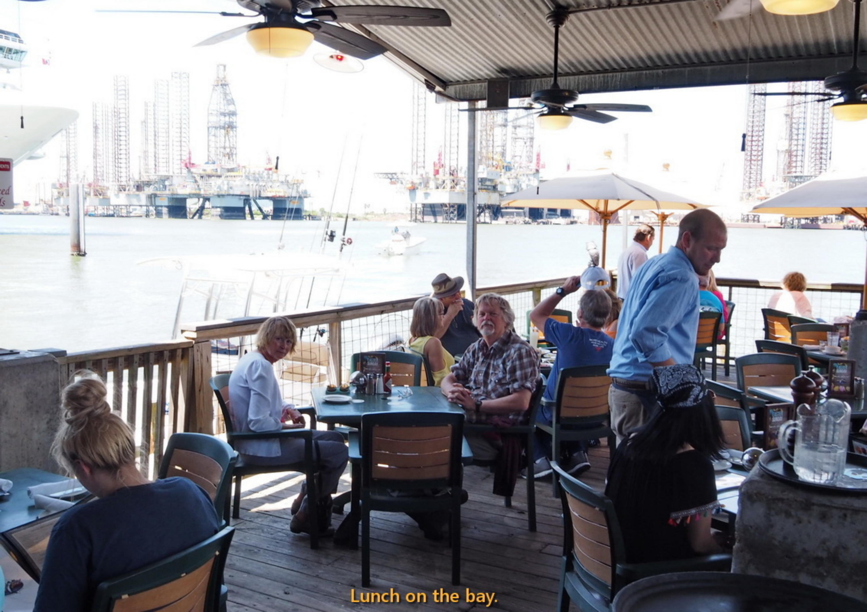
Lunch on the bay.