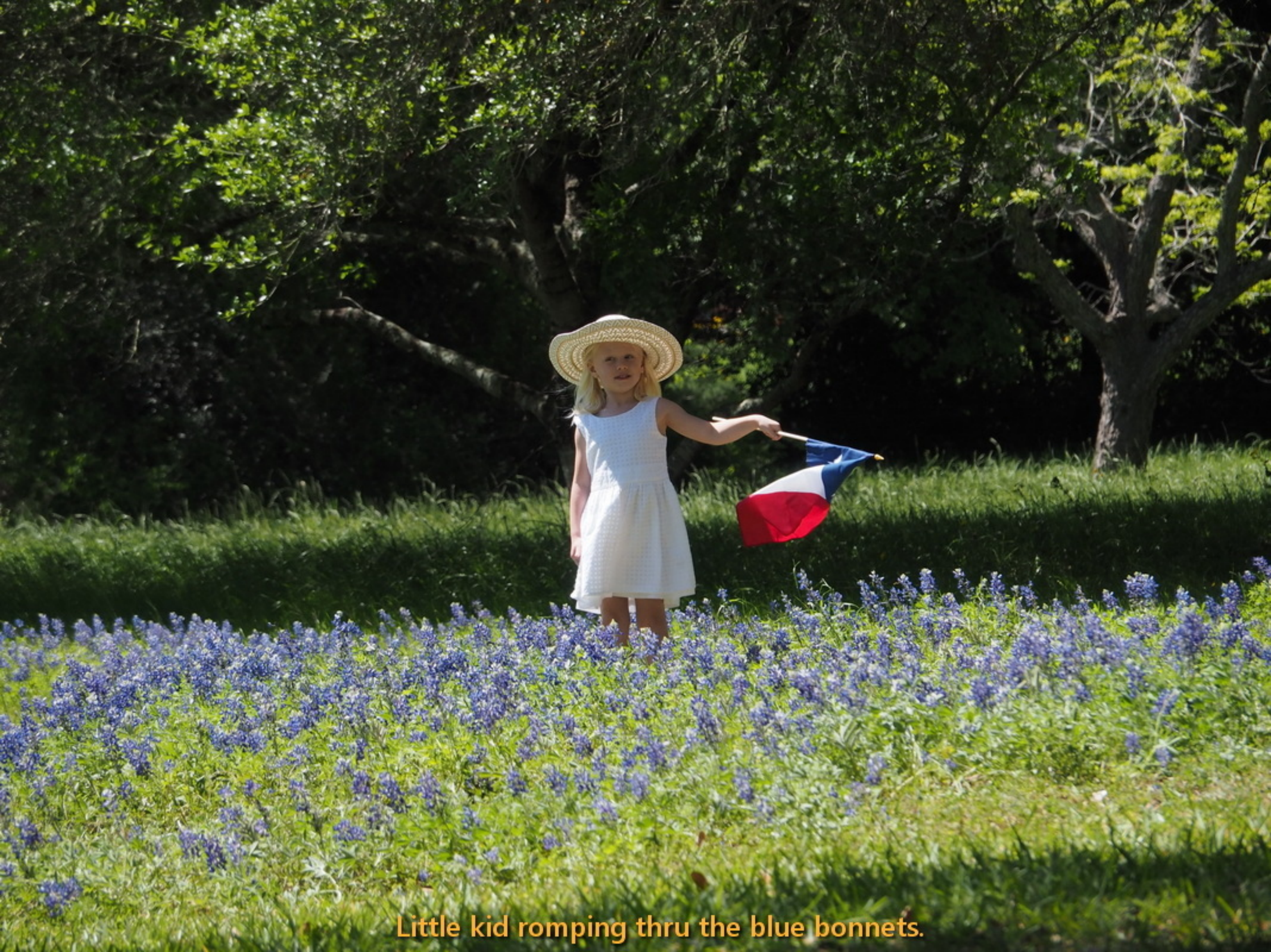
Little kid romping thru the blue bonnets.