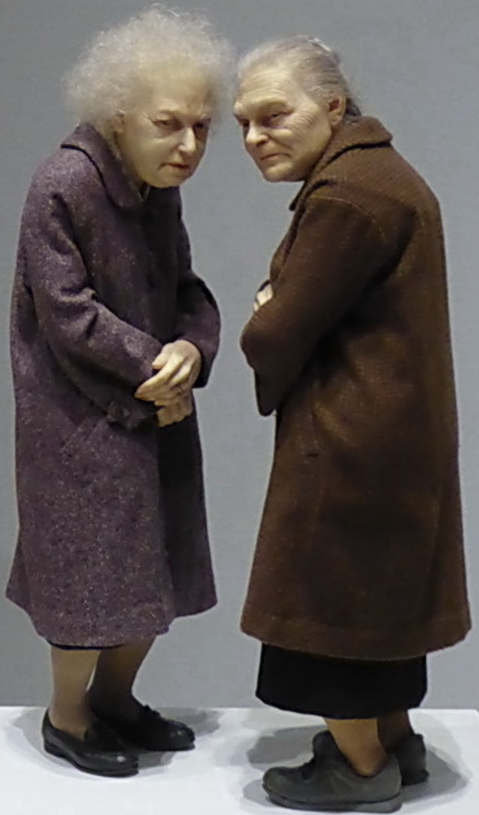
A special exhibit of Ron Mueck sculptures...