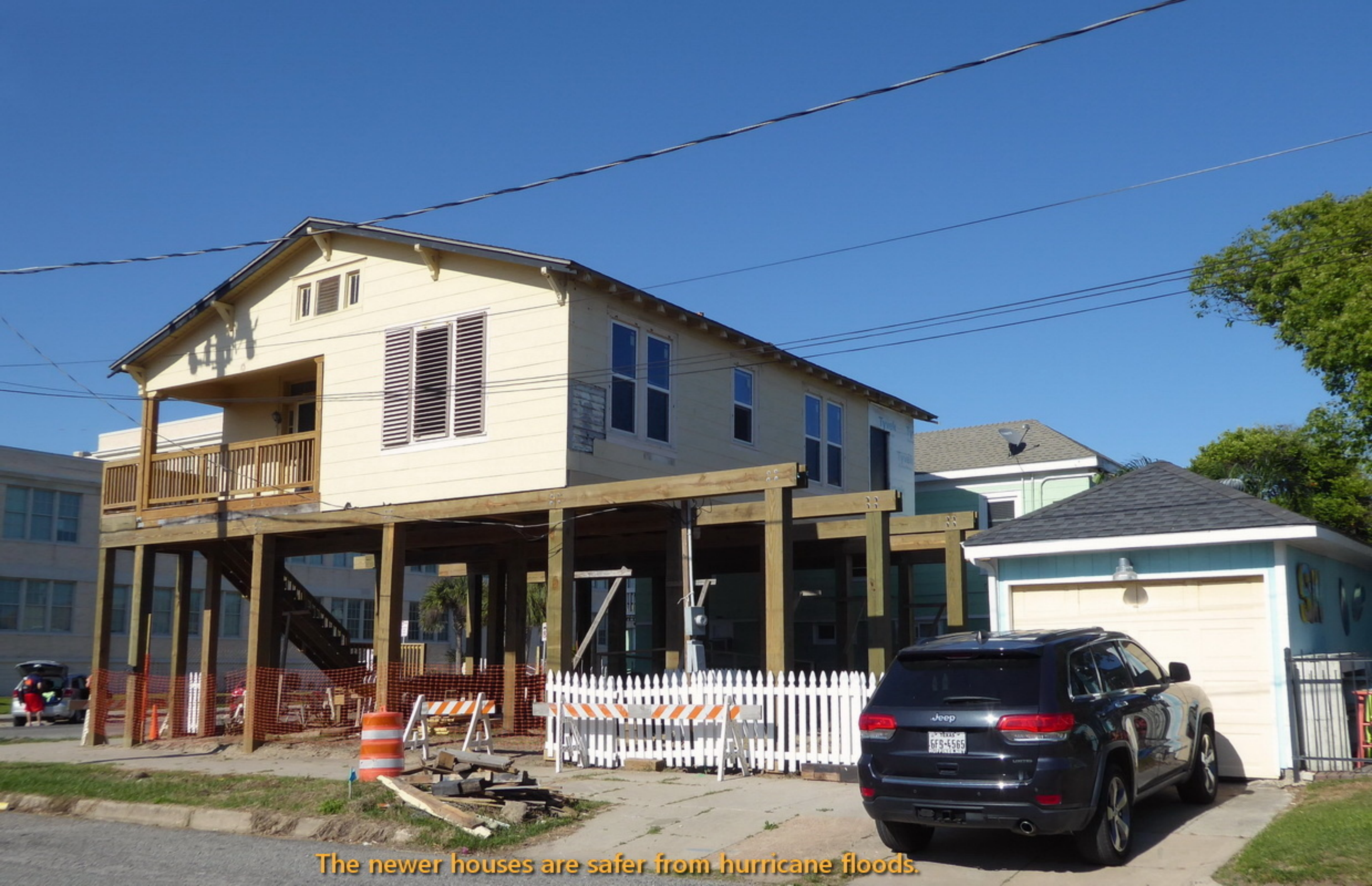
The newer houses are safer from hurricane floods.