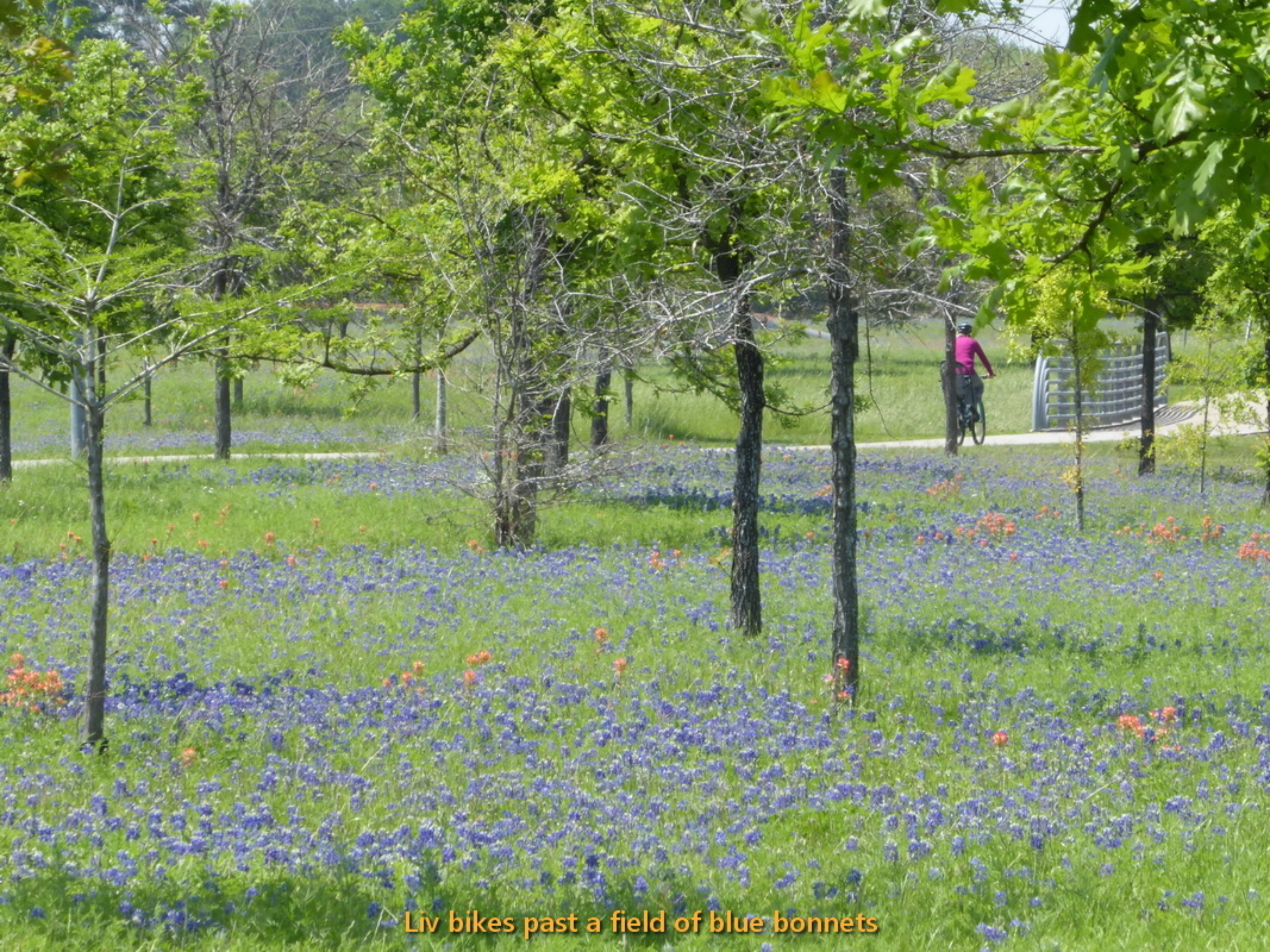
Liv bikes past a field of blue bonnets