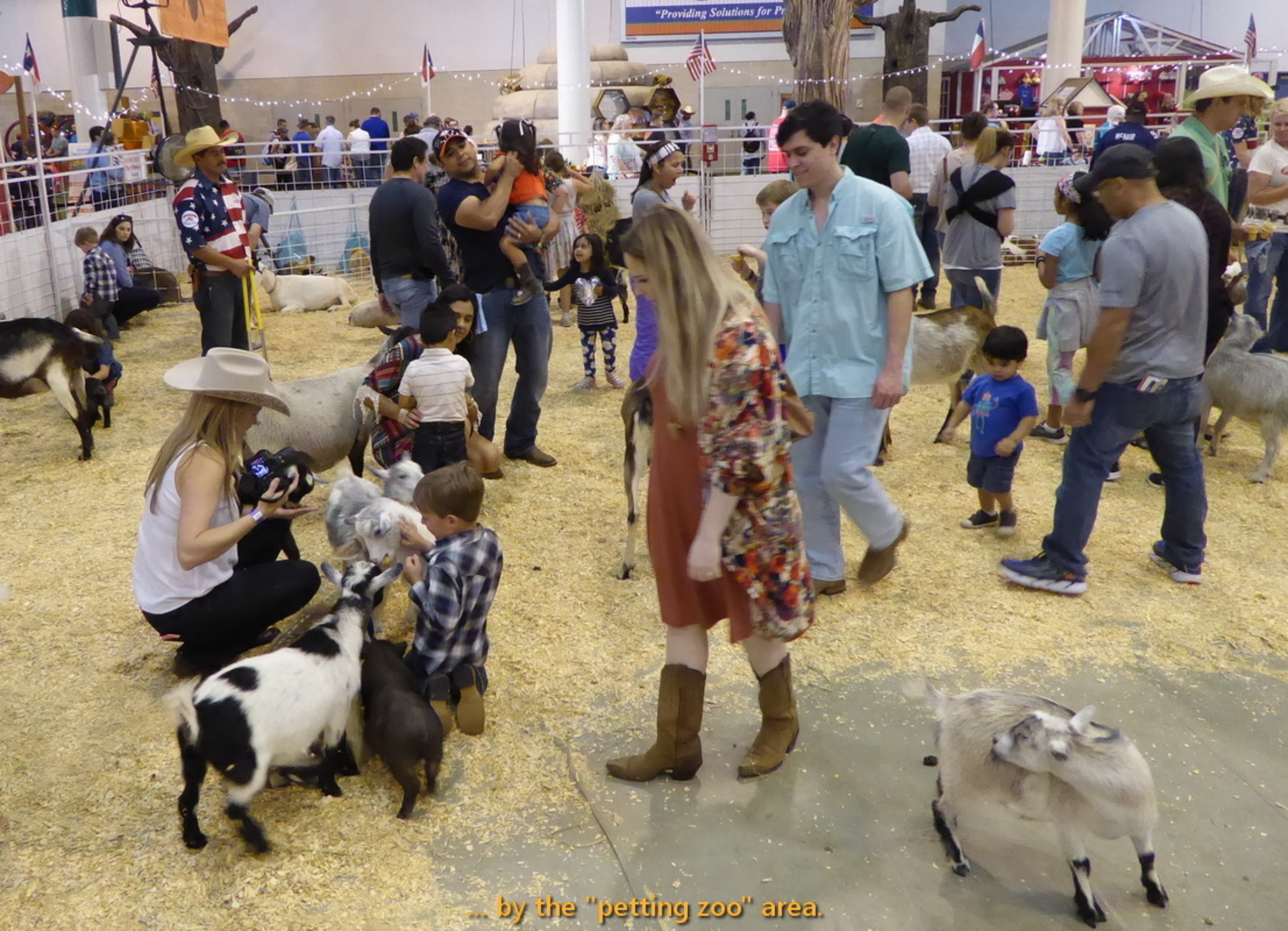
... by the "petting zoo" area.