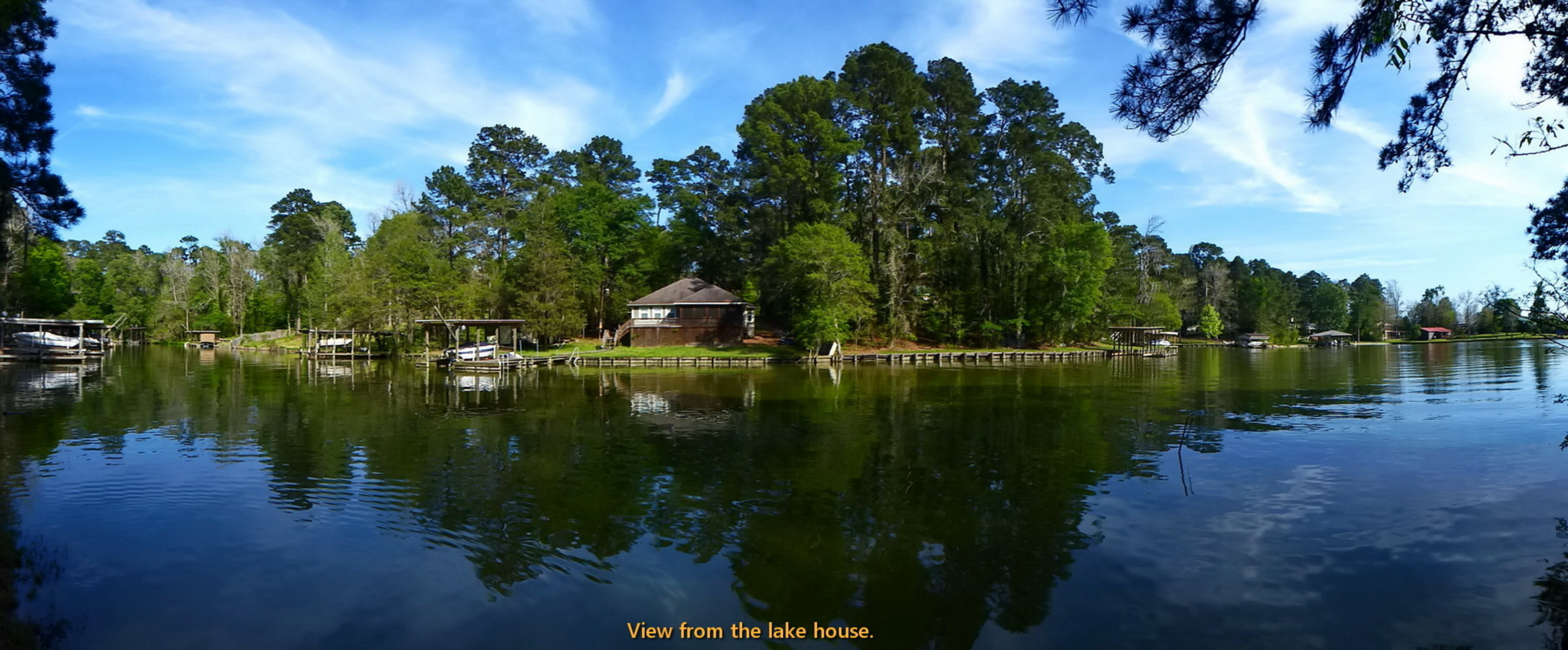
View from the lake house.