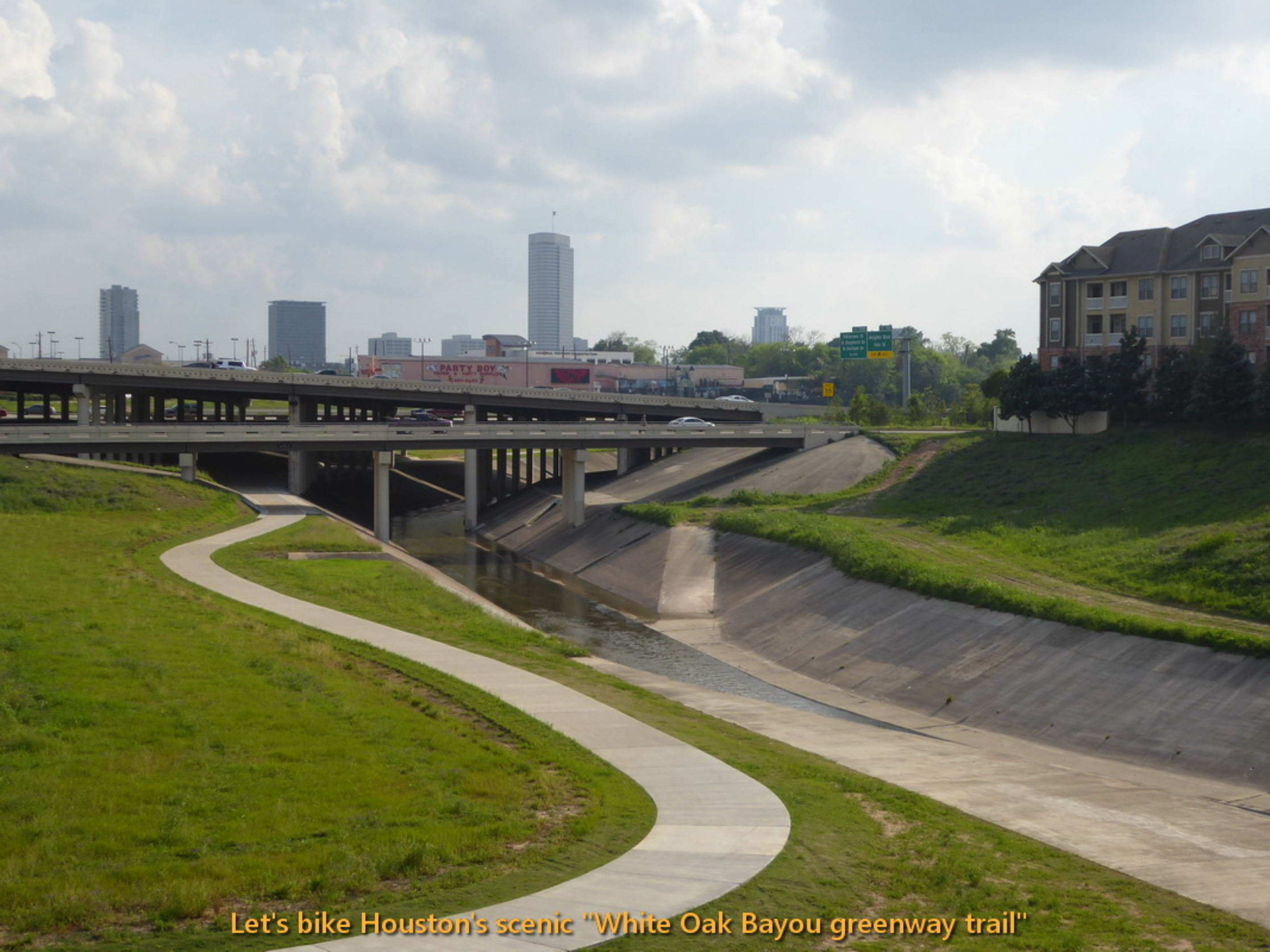
Let's bike Houston's scenic "White Oak Bayou greenway trail"