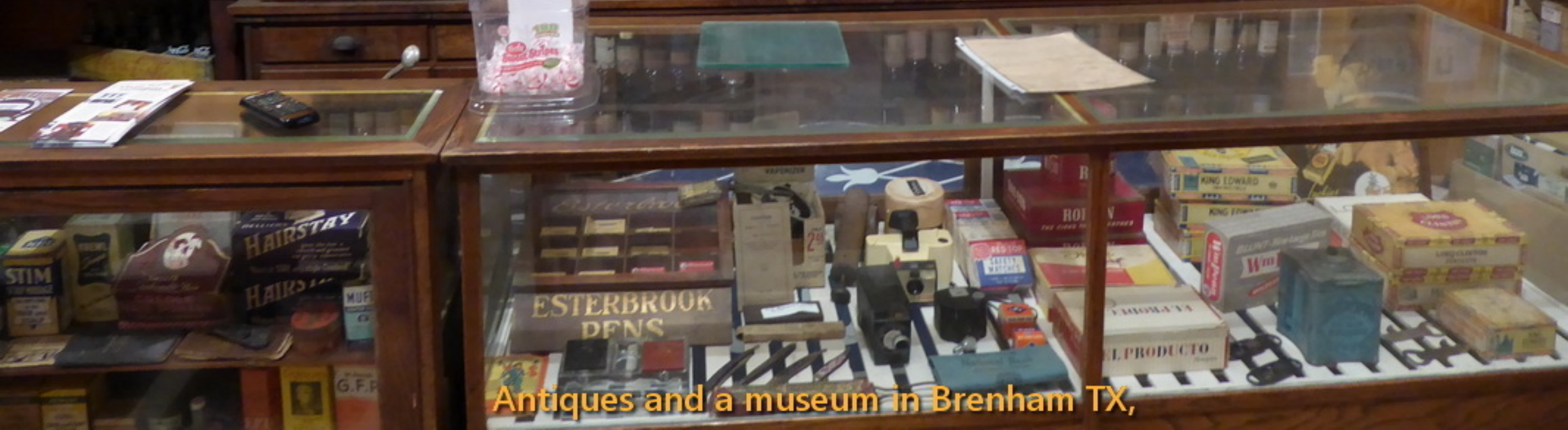
Antiques and a museum in Brenham TX,