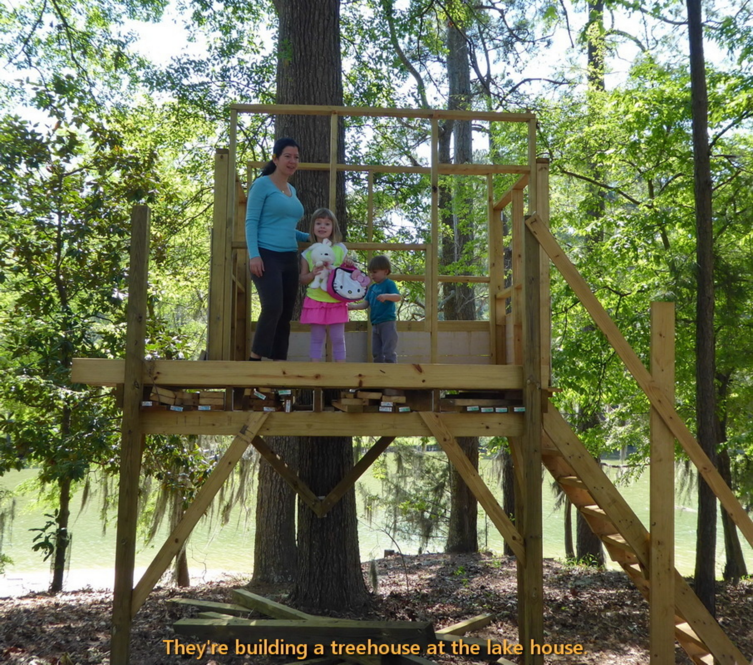
They're building a treehouse at the lake house.