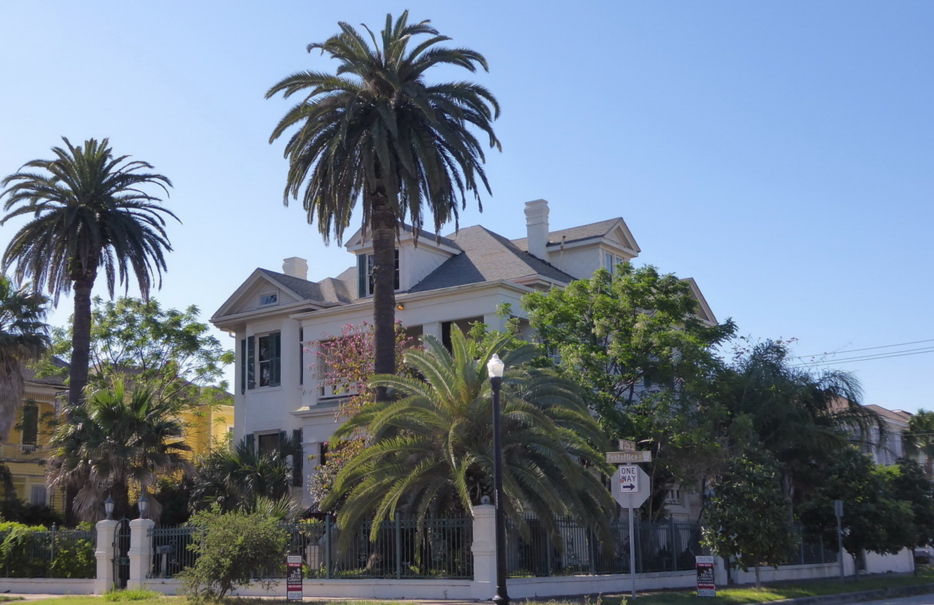
Galveston is famous for its old Victorians