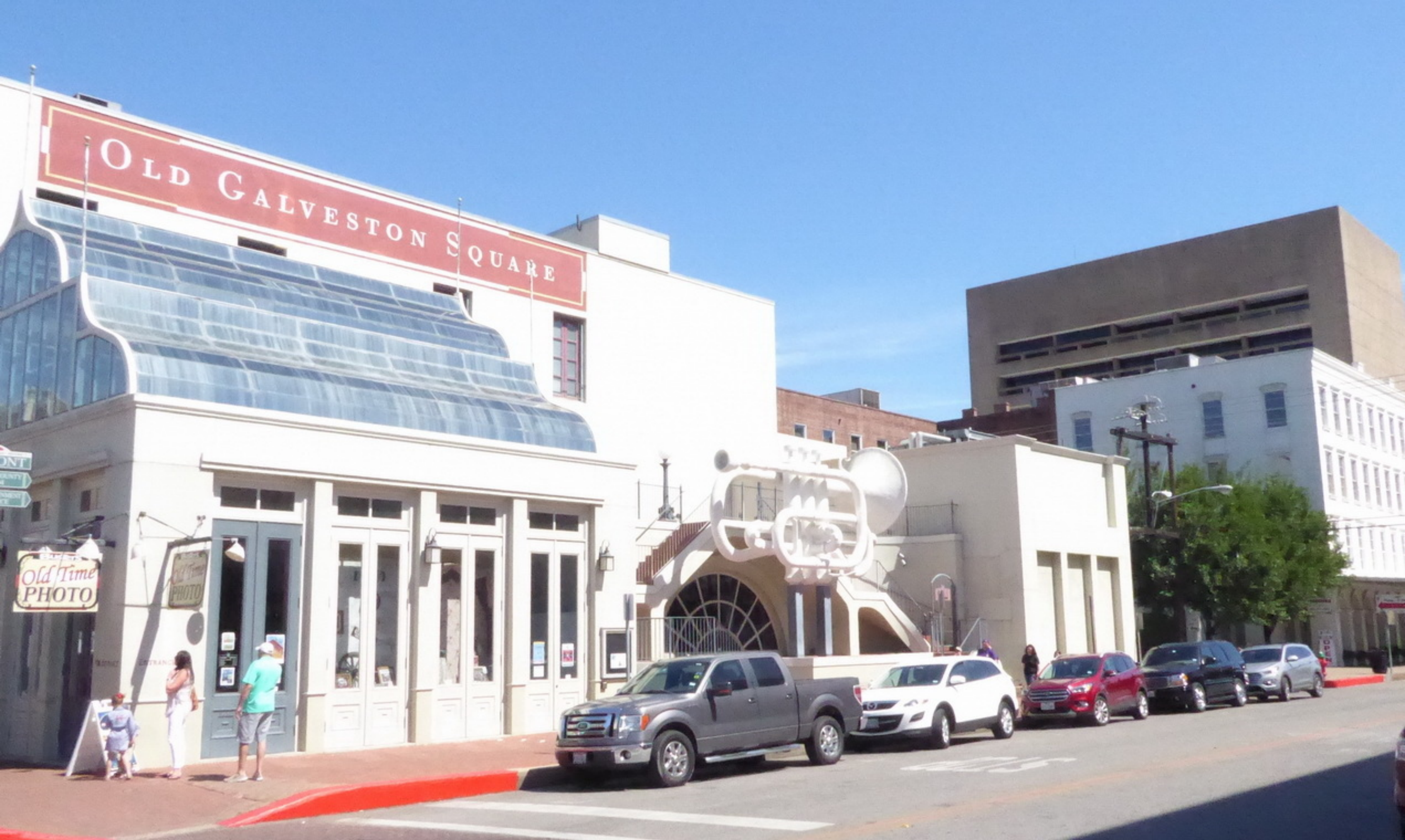
And then another road trip: Galveston!