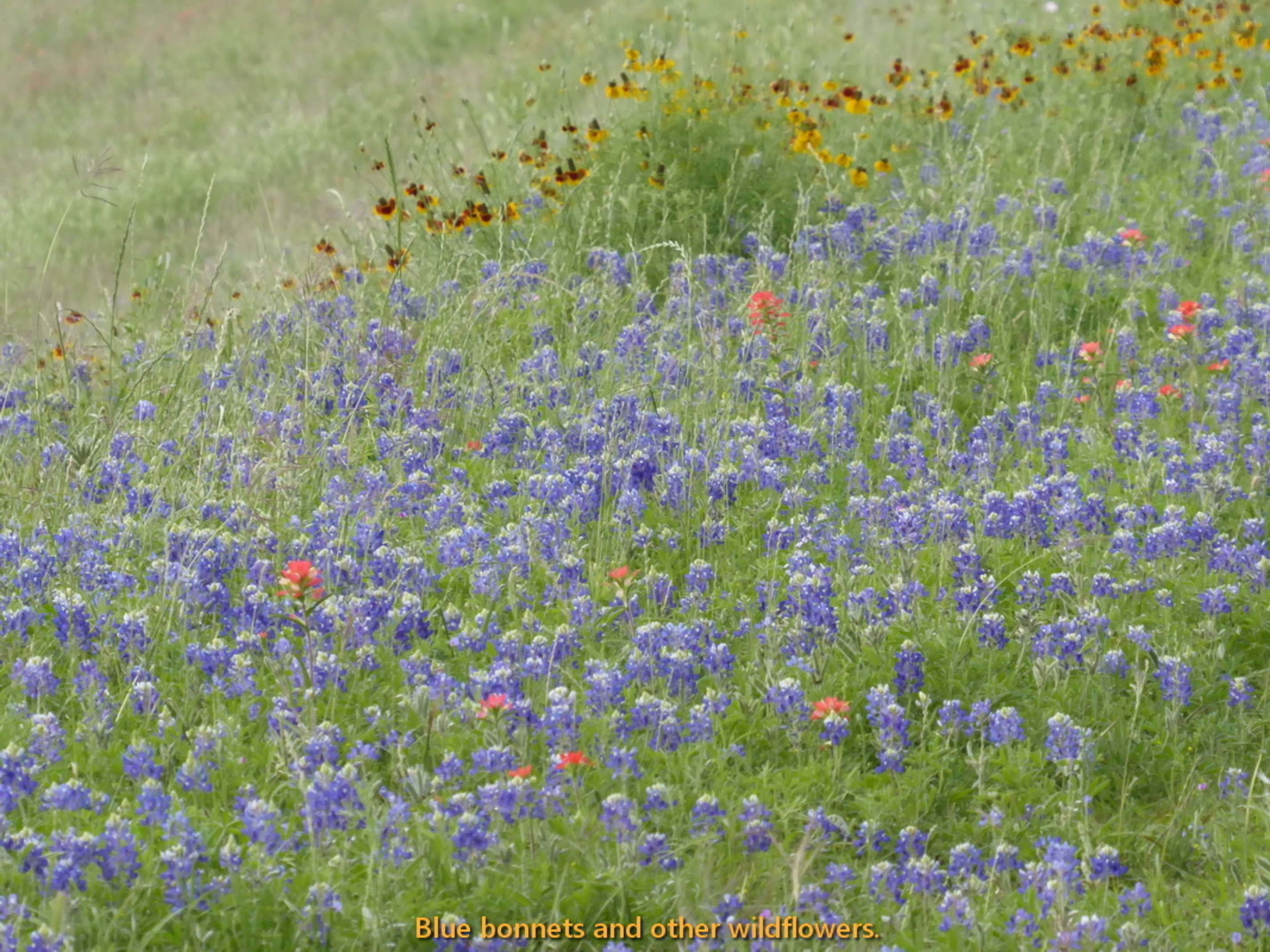
Blue bonnets and other wildflowers.