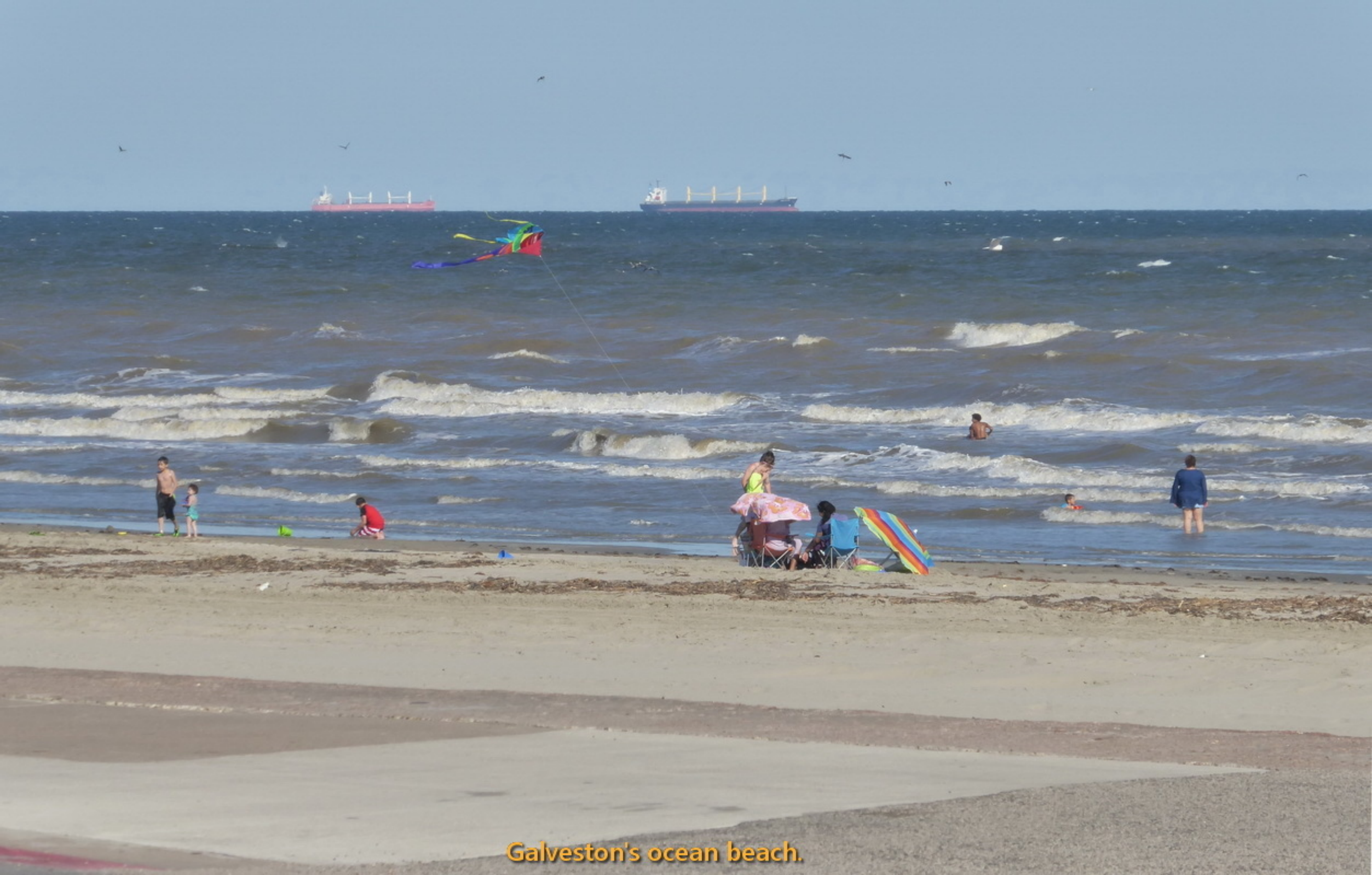
Galveston's ocean beach.