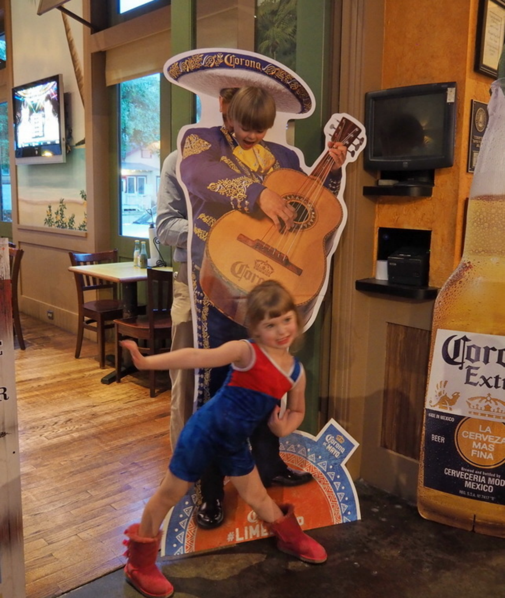
Dinner and a dance.