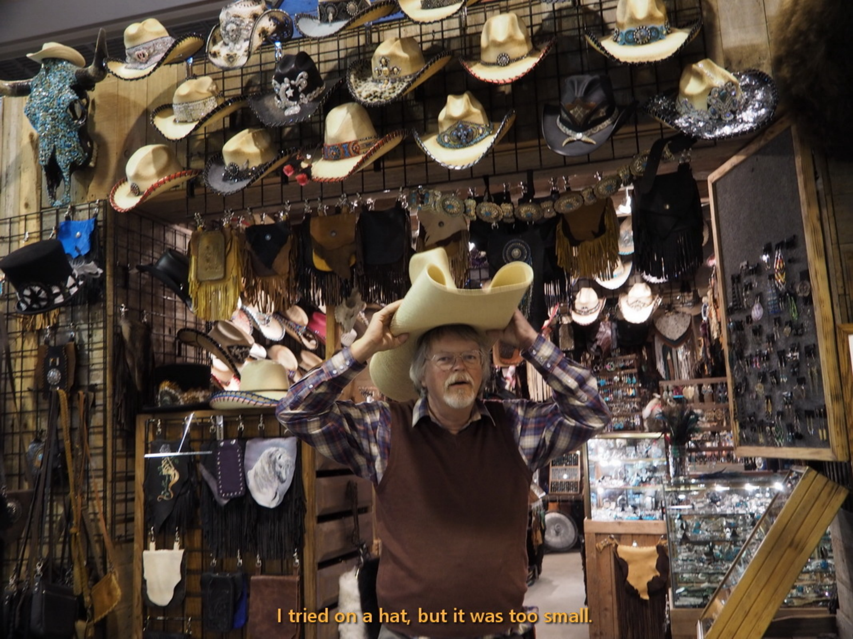
I tried on a hat, but it was too small.