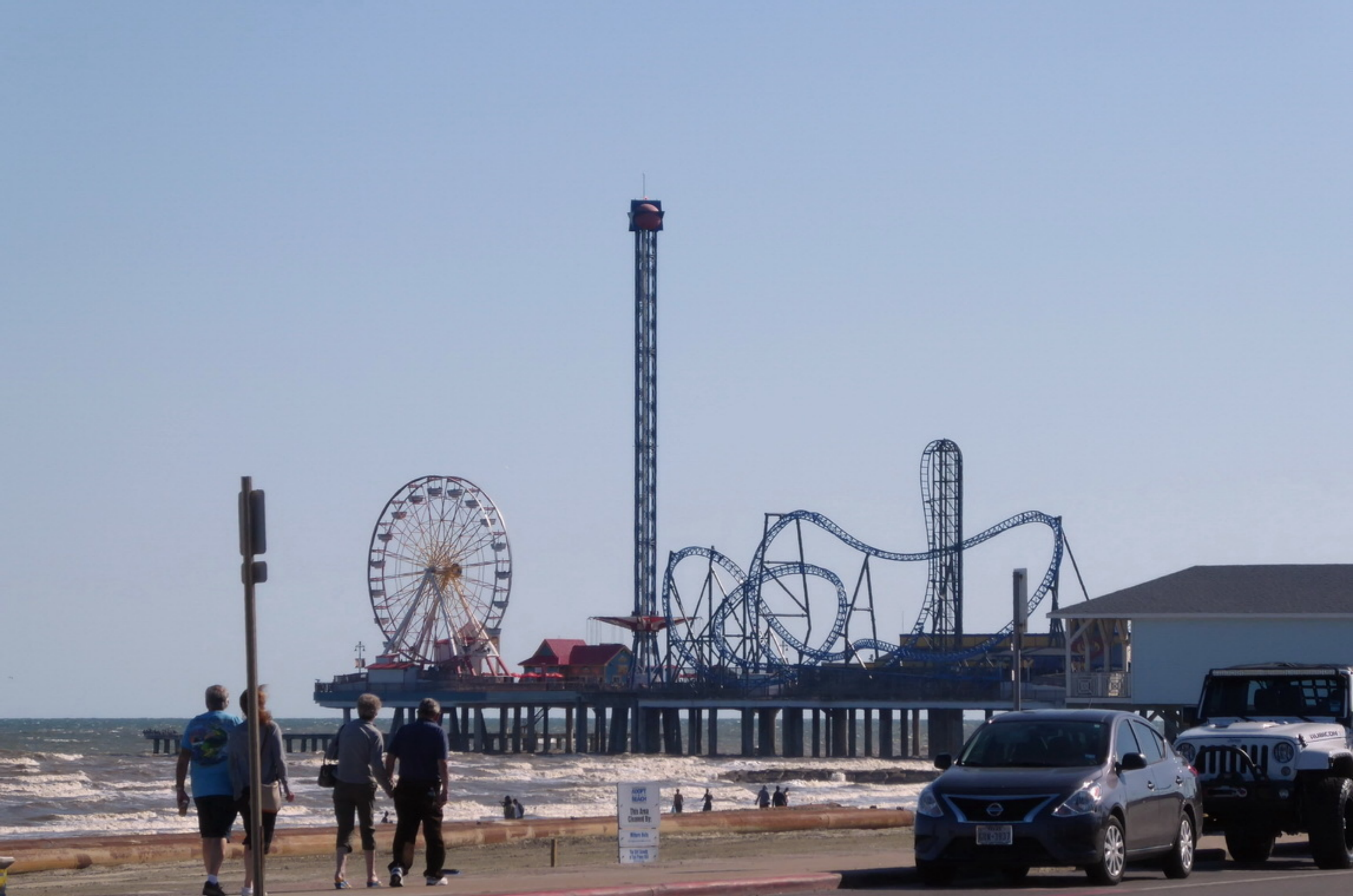
... and go past the Pleasure Pier on the way back out of town.