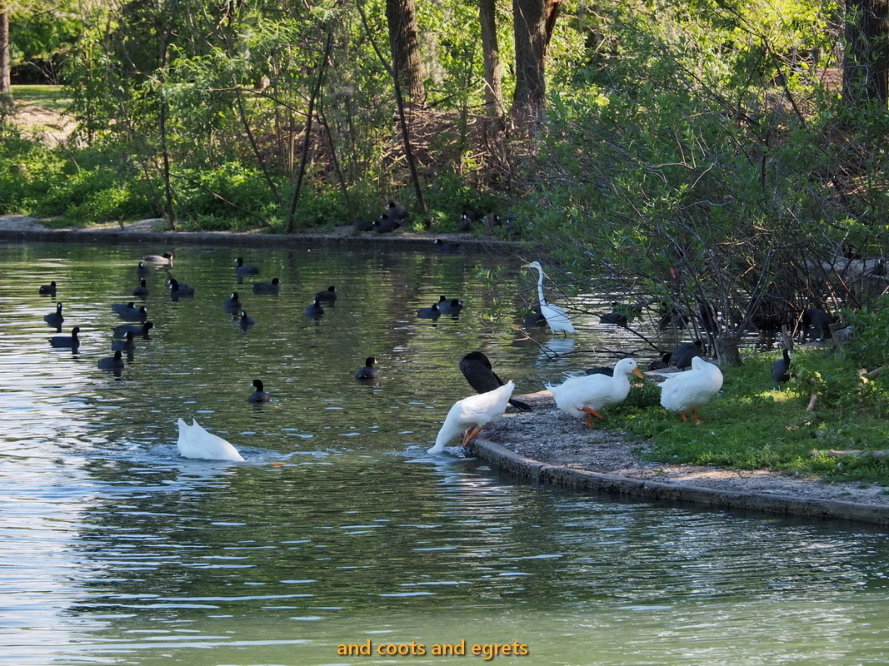
and coots and egrets