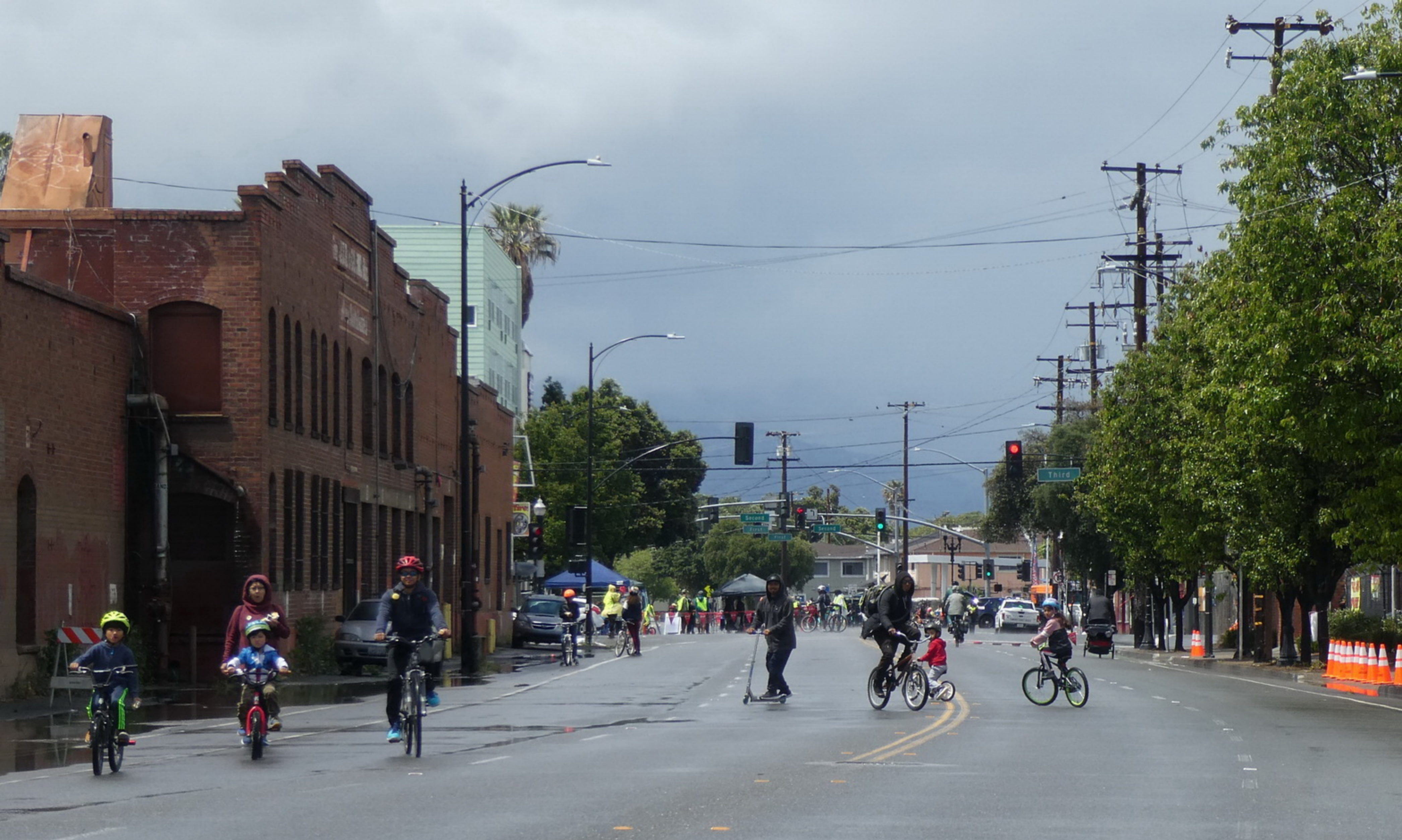
Bicycles, scooters, strider bikes, bikes with training wheels, even a unicycle.