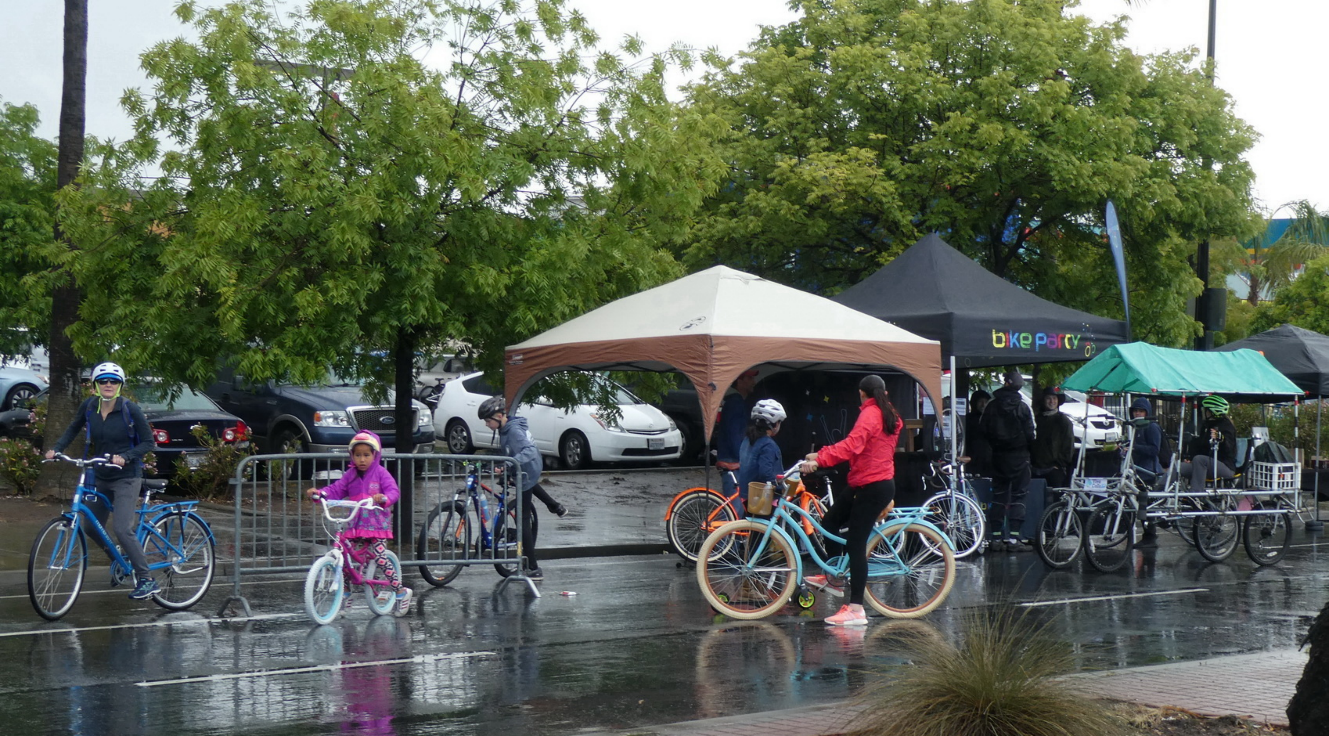
Passing a Party Bike parked at a Bike Party booth.