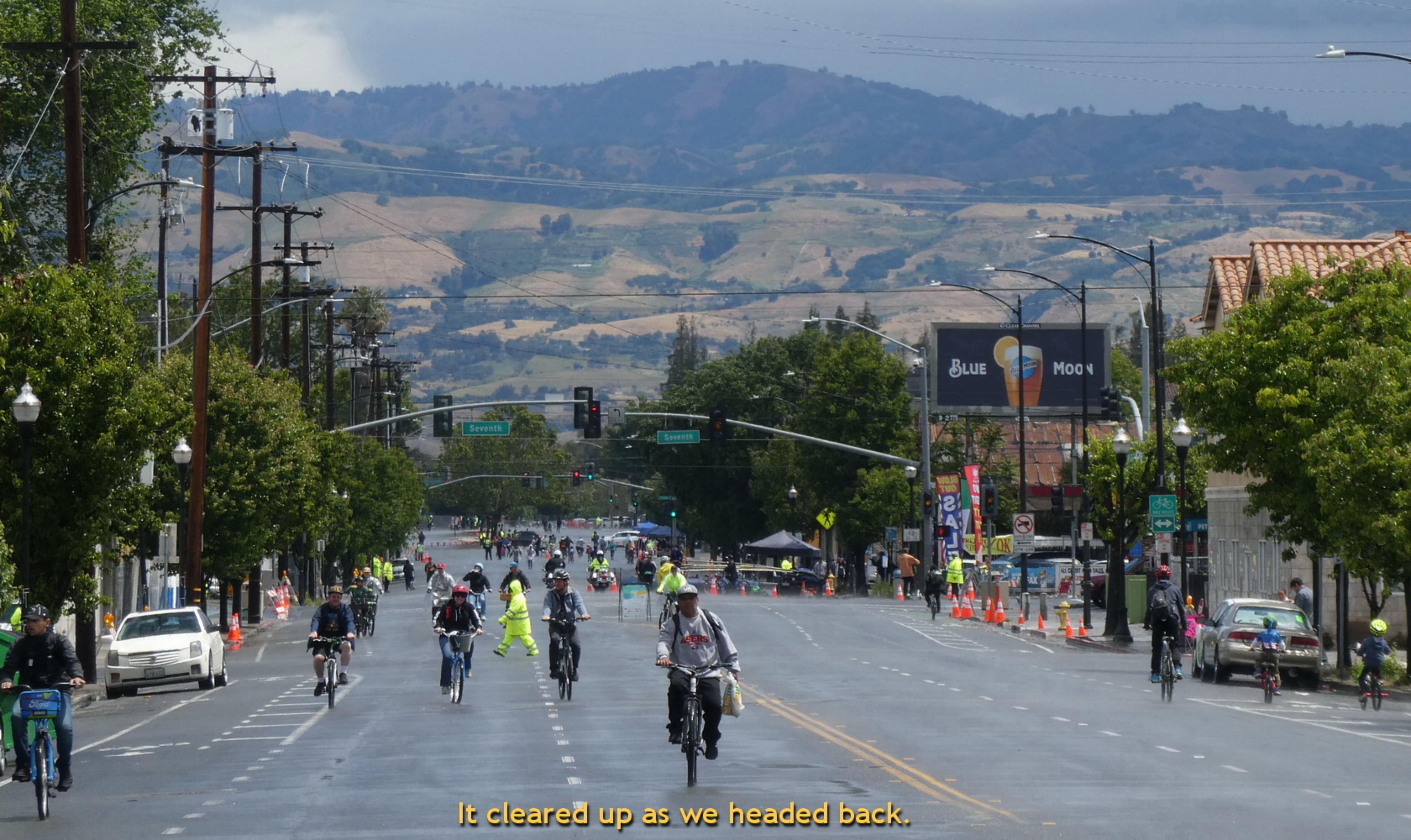
It cleared up as we headed back.