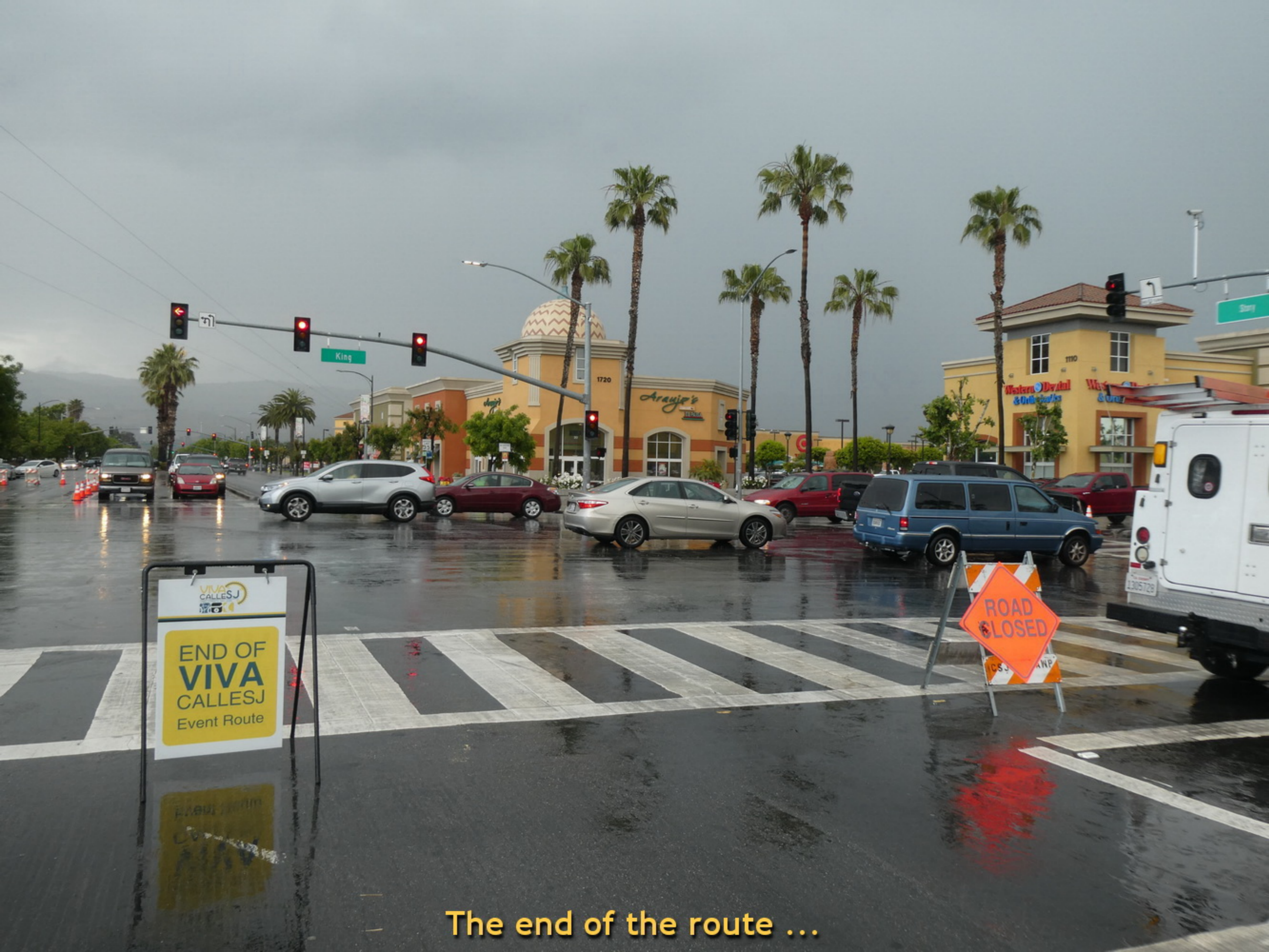
The end of the route ...